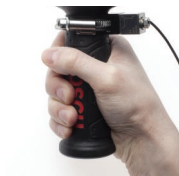
SV 150 Tri-Axial Hand-Arm Vibration MEMS Accelerometer