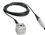
SV 151 Tri-Axial SEAT Vibration MEMS Accelerometer