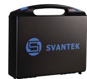
SA 146 Carrying Case for SV 106D and accessories