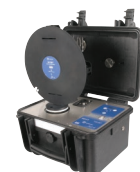
SV 111 Hand-Arm and Whole-Body Vibration Calibrator