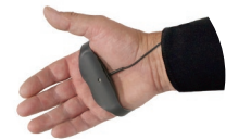
SV 105F Tri-Axial Hand-Arm Vibration Accelerometer with Force Detection